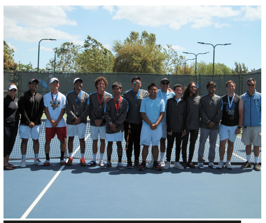
The Heritage boys tennis team brought home its sixth straight league title

The Patriots continue to hold a one-game edge over Freedom in the BVAL standings, after their 11-1 win over Antioch on Thursday and 4-0 win over Liberty this past Tuesday.